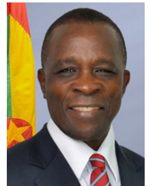
Prime Minister, Dr. the Rt. Hon. Keith Mitchell

several initiatives designed to support the expansion of existing micro, small and medium enterprises and the creation of new ones.