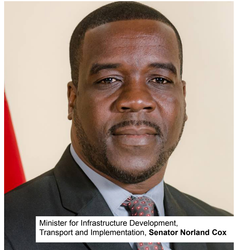
Minister for Infrastructure Development, Transport and Implementation, Senator Norland Cox

The de-bushing programme serves two key objectives, one of which is to ensure road safety by ensuring roads are safe for