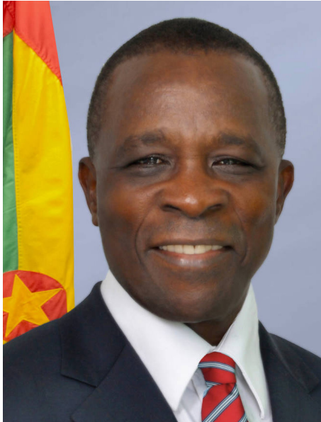
Prime Minister, Dr. the Rt. Hon. Keith Mitchell

Dr. Mitchell stated in his letter, "The people of St. Lucia have spoken decisively, voting for SLP candidates in 13 of the 17 constituencies. This is a resounding vote of confidence in a period when so many things are uncertain, as we continue to contend with the widespread impact of the COVID-19 pandemic."